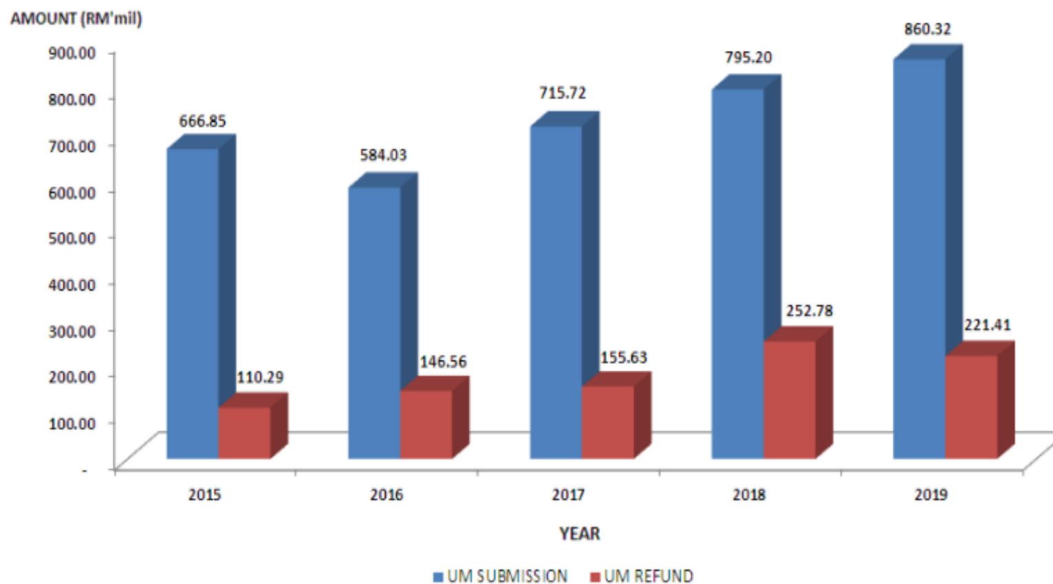
STATISTIC OF UNCLAIMED MONEYS SUBMISSION AND REFUND FROM 2015 UNTIL 2019